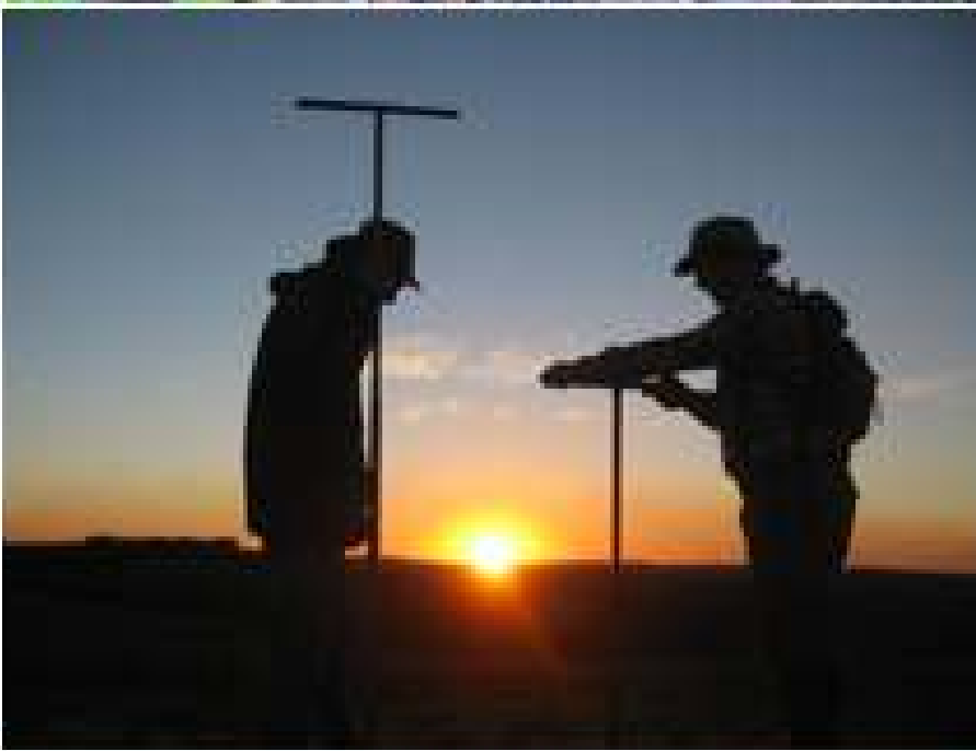
Peculiar Duplex, Riversdale, SA.