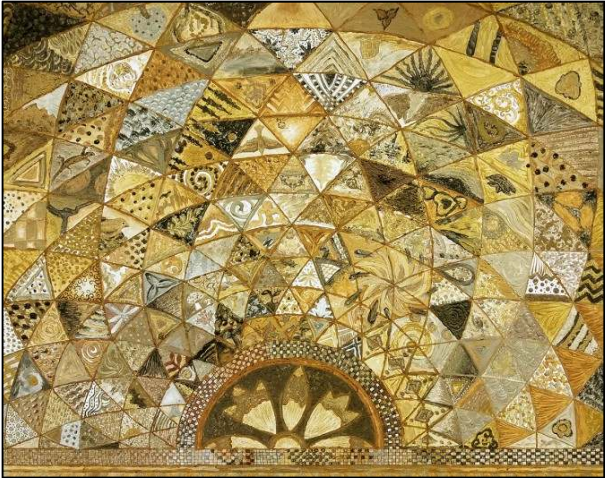
Photo: A mosaic-like design created by Cornell community members.

with food and fiber, and we can use soil to help fight climate change. We've got lots of great reasons to celebrate soil."