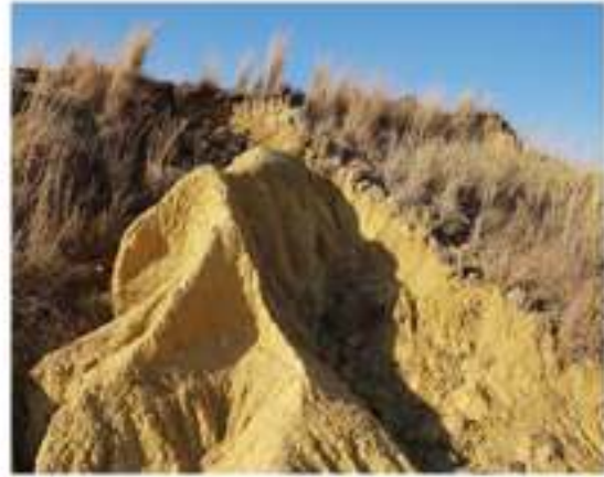
Bergville, KZN