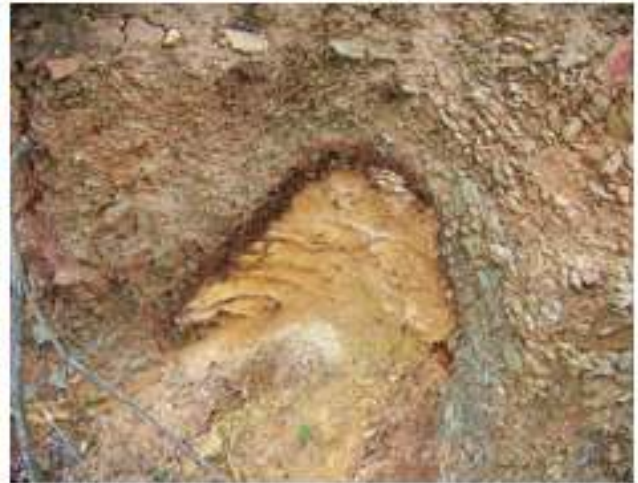
Enigmatic Glenrosa. Overberg, S Cape.