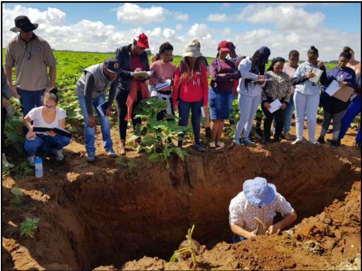
SAGO-lede by 'n profielgat tydens die Lichtenburg-werkswinkel.

Hierdie werkswinkel is by SARNAP geregistreer en bywoners kon CPD-punte vir bywoning eis. Besoek gerus SAGO se webtuiste by www.sasso.co.za