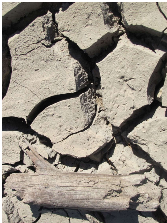
Cracks Everywhere! (Cobus Botha)