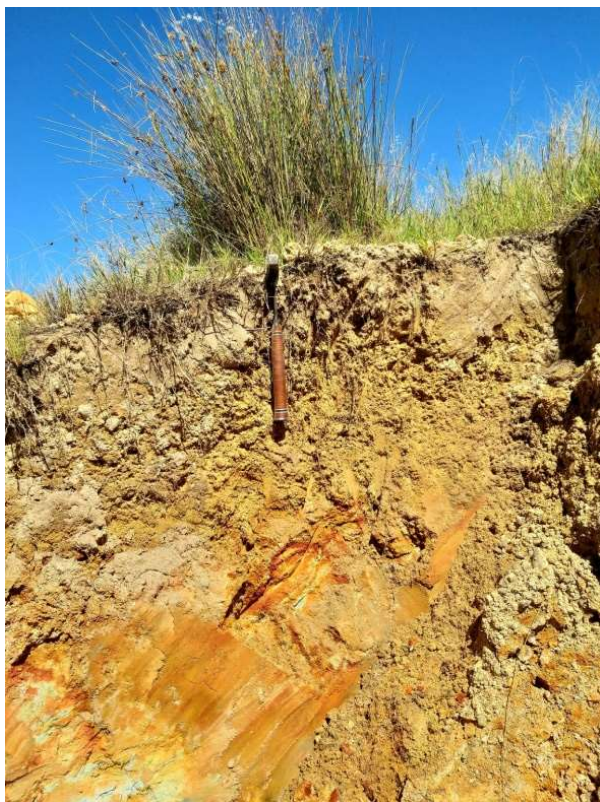
Wetland Juncus Effusus on a wet sand in Citrusdal (Sikho Gobozi)