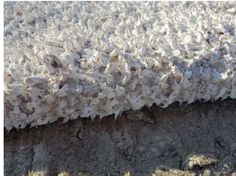
Orthic Icing ( Cathy Clarke )