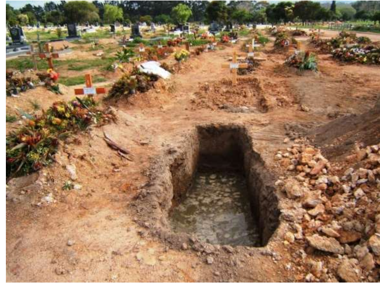
Hydro-Cemetery ( Freddie Ellis )