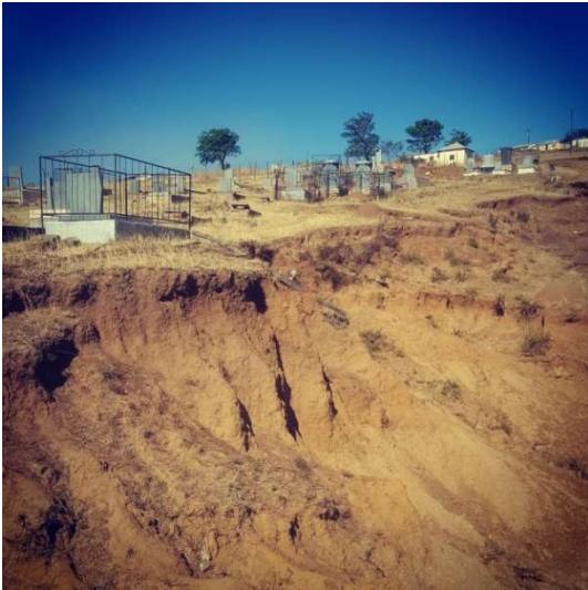
Eroding Graveyard