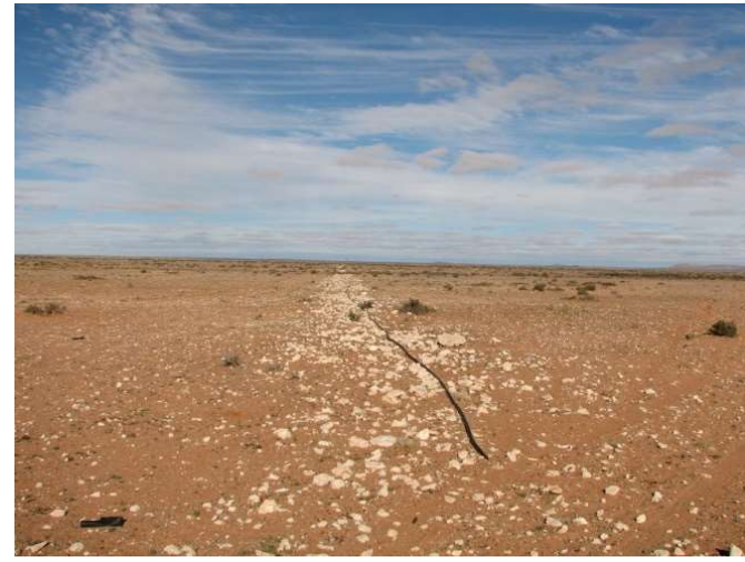
Pipeline to Pofadder ( Kurt Barichievy )