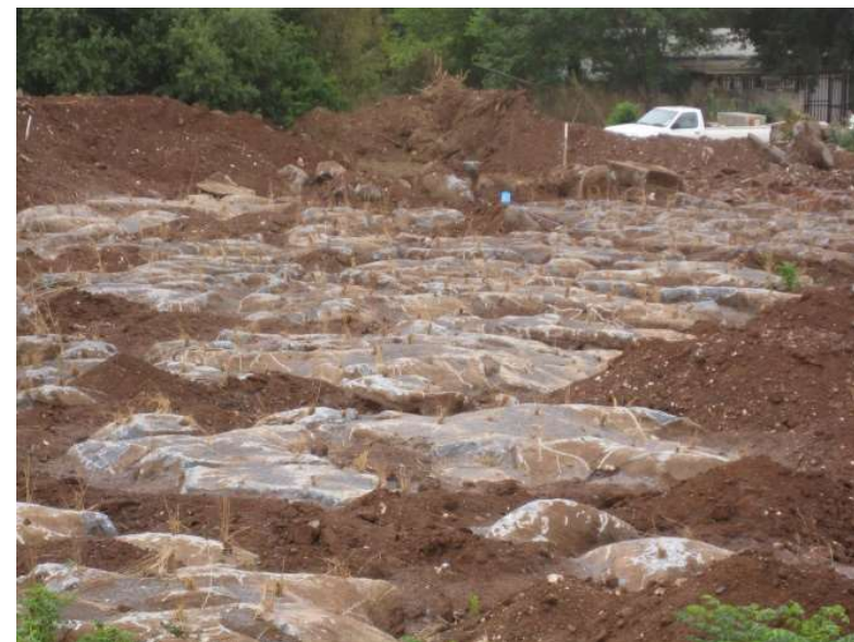
Dolerite bedrock, Gautrain route (Garry Paterson)